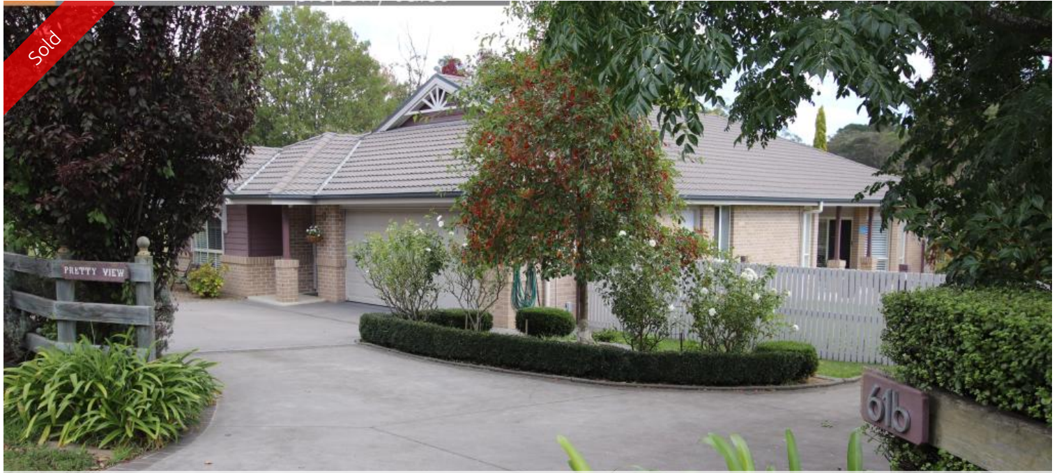
61B Southey St, Mittagong