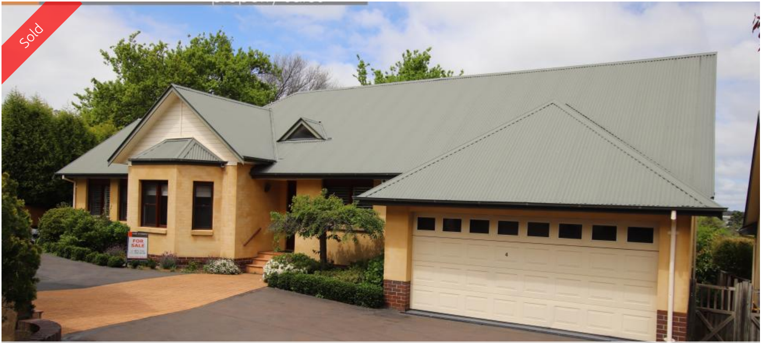
Villa 4, 130 Mittagong Rd, Bowral