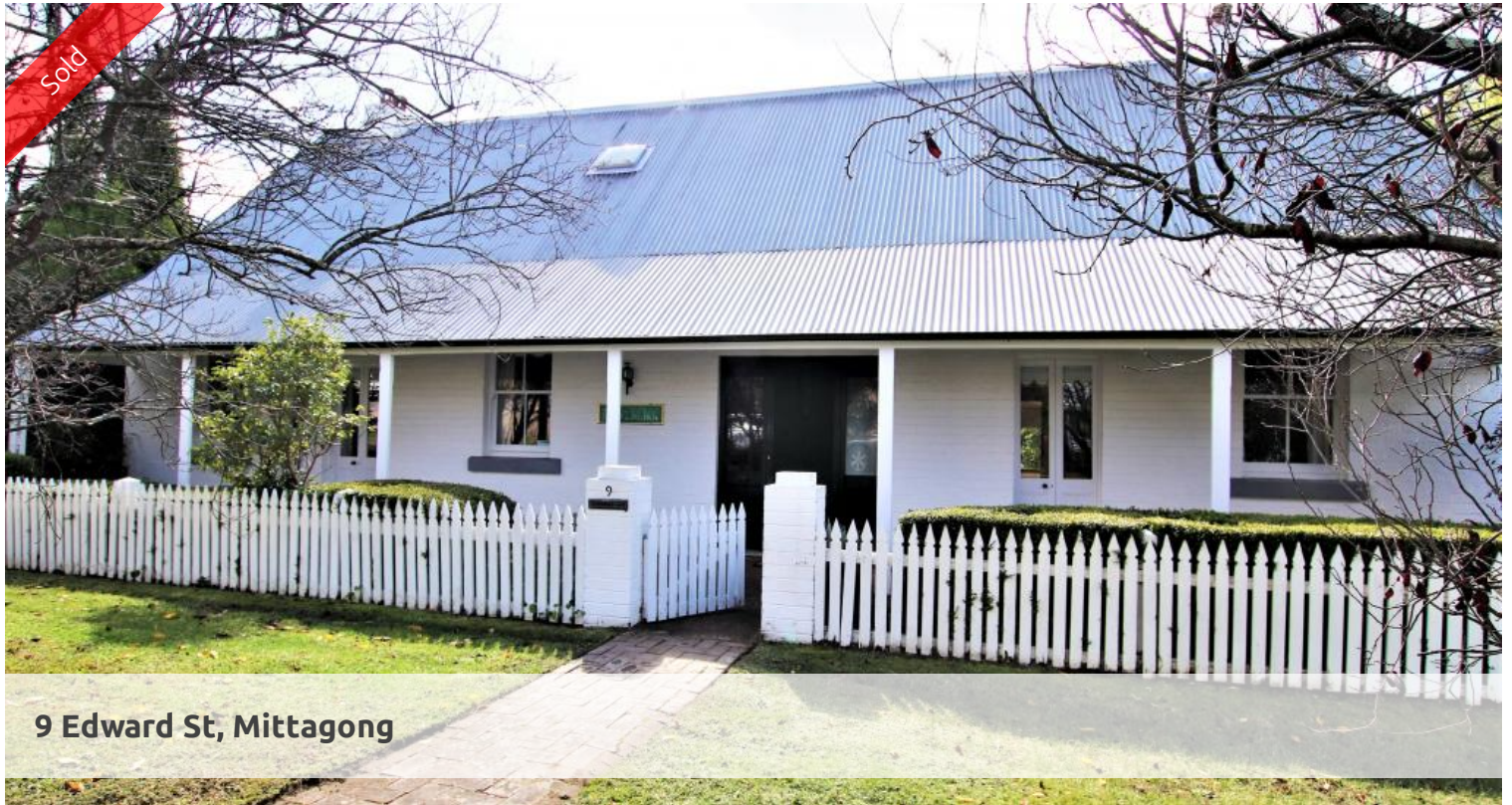
9 Edward St, Mittagong