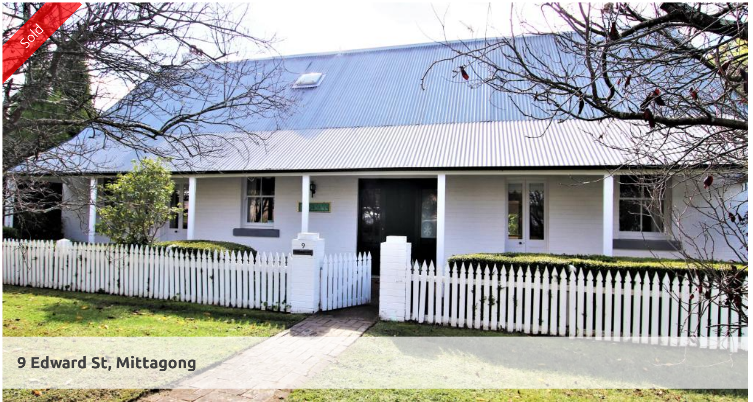
9 Edward St, Mittagong