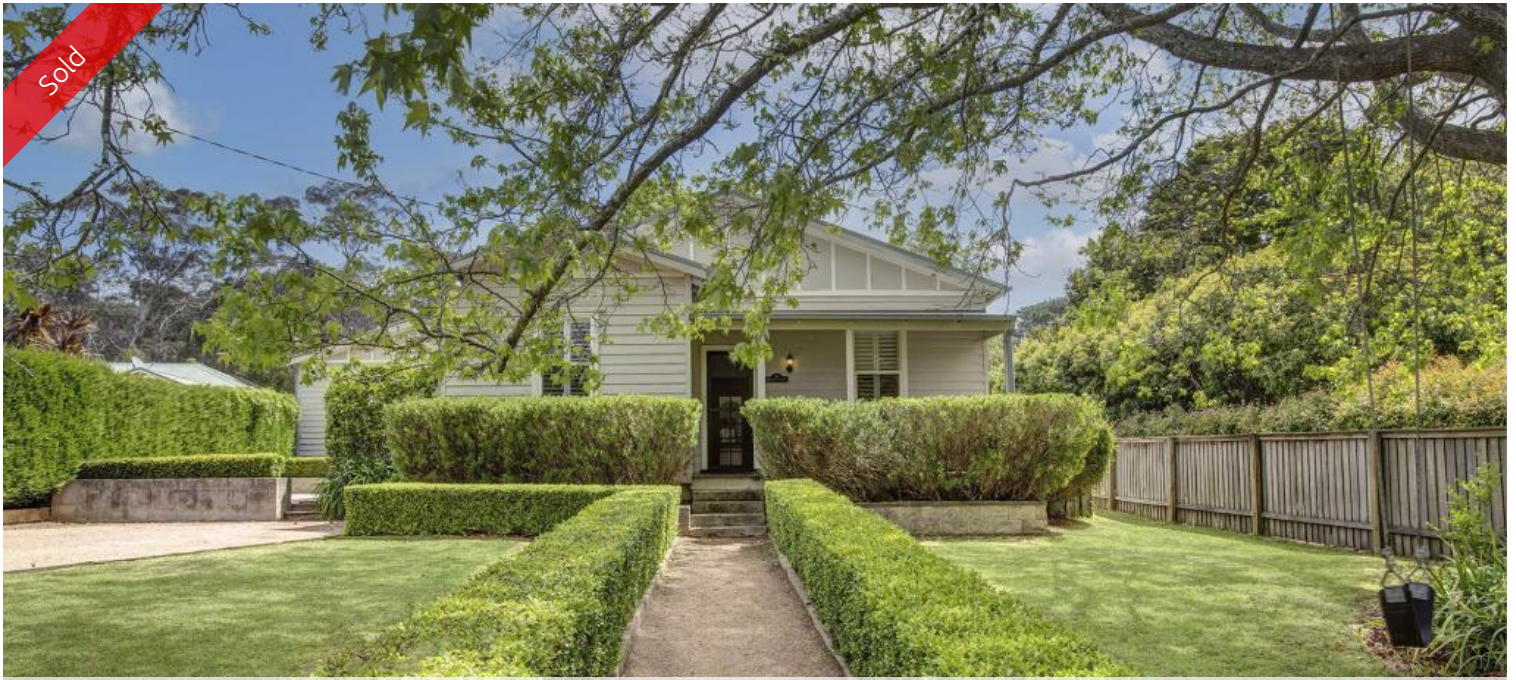
3 Evans St, Mittagong