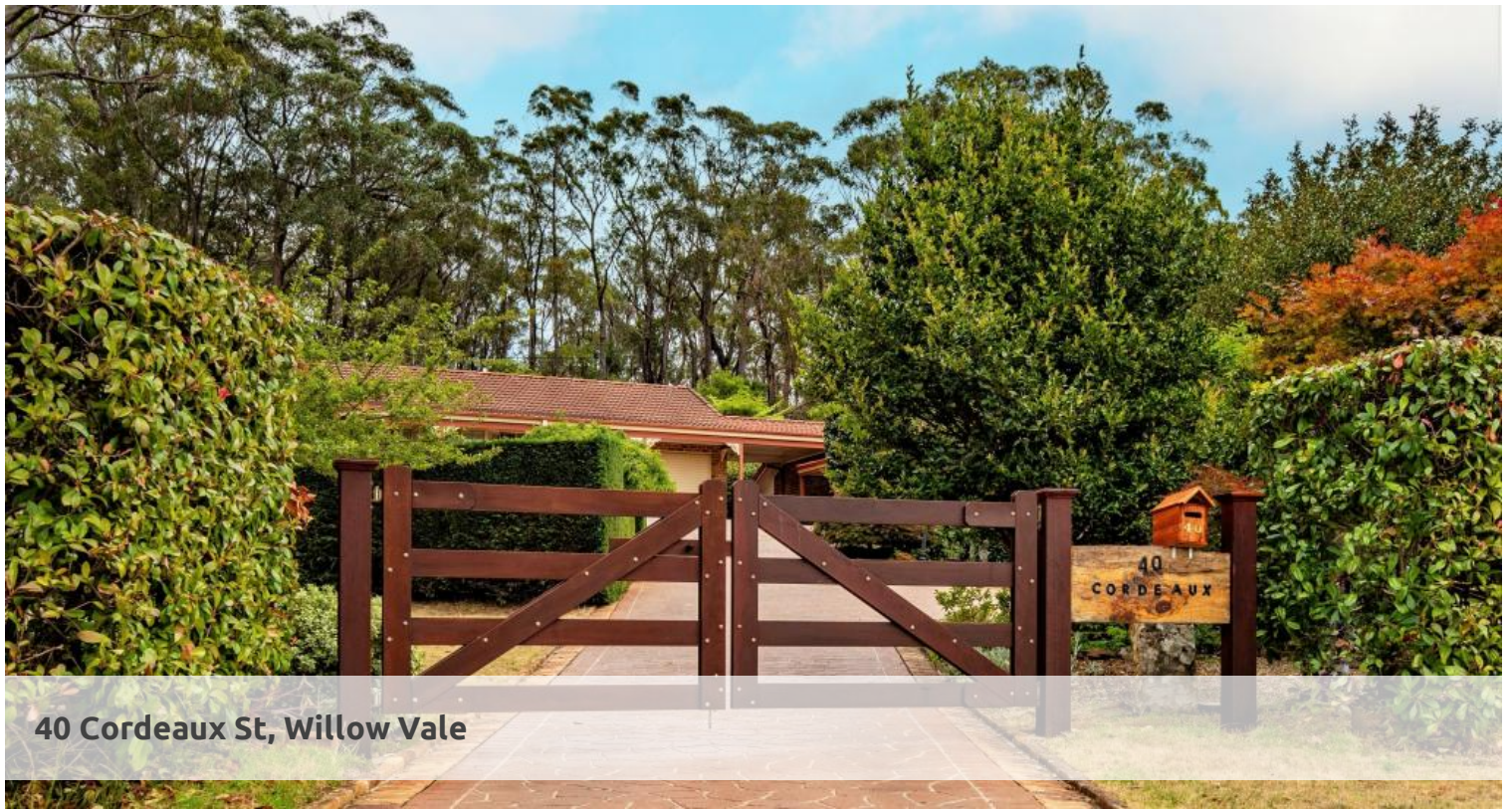
40 Cordeaux St, Willow Vale